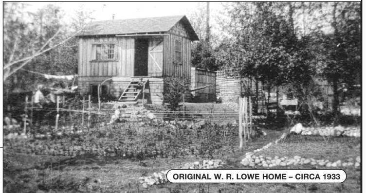
ORIGINAL W. R. LOWE HOME - CIRCA 1933