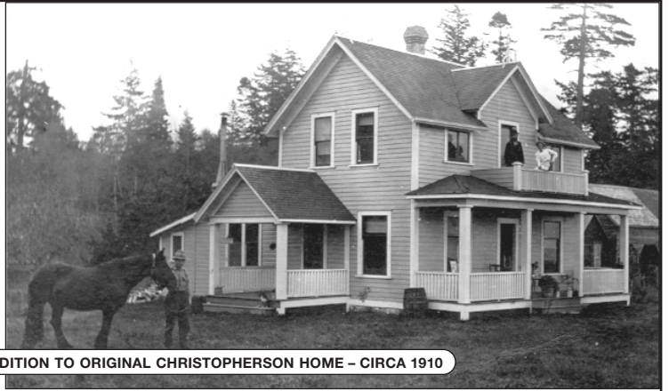
ADDITION TO ORIGINAL CHRISTOPHERSON HOME - CIRCA 1910