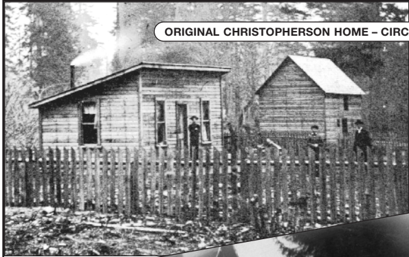
ORIGINAL CHRISTOPHERSON HOME - CIRCA 1905